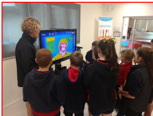
Excursion to Biolab

Contact the school office to obtain a CSEF application form.