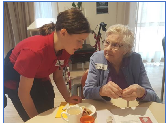
Visit to the Lorne Community Hospital

Bikes are kept behind the garden shed during the school day. VicRoads recommends that children under the age of twelve years should ride under adult supervision. We run a bike education program for all students every 2 years.