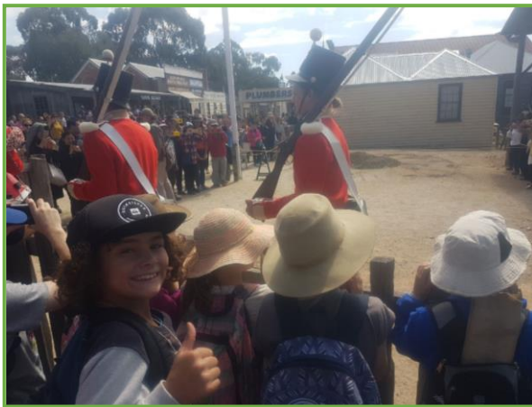
Sovereign Hill Camp

Camping activities are conducted for grades 3-6 on a four year rotation, usually in Term 1 or 2. The 2023 school camp is to the Urban Camp in Melbourne with students from Forrest, Alvie and Beeac schools also attending. In 2022 the students went to Sovereign Hill and in 2021 the camp was held at Roses Gap. The 2024 camp will be to Anglesea.